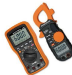
Test & Measurement