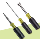
Screw Drivers & Nut Drivers